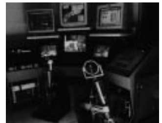
Fig.- 1 Interface JPLAT.

The Figure 1 [FIORINI 93] JPLATOP: Jet Propulsion Laboratory Advanced TO presents a complete user interaction for advanced TO of two static robot arms, the user needs to handle 6 different monitors!.