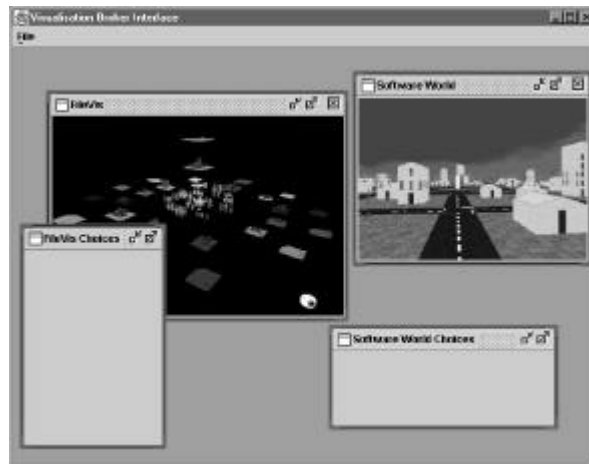
Figure 4 - Multiple visualisation interface

This is not so much about designed a visual (or visualisation interface) per se, but providing an application “container” to allow the user control of what they want to see and do. The component creators do impose some restrictions in what they provide for the user, but by having enough different components available should overcome this problem. There is obviously the side issue of having to define specifications of the interfaces at the component level, but this is hidden from a user of the visualisation application!