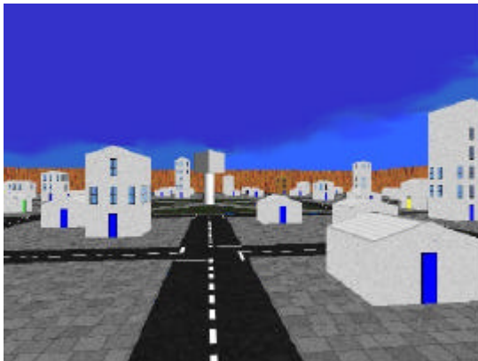
Figure 1 - District within Software World

The above literature showed that visualisation can be a good way of providing intelligence amplifying tools for the analysis and understanding of complex data sets. This is essentially what all visualisations are trying to do, although variations along the teaching/learning and statistics avenues do exist. It can also be seen in the above sections. In the work done to date on software visualisation [Knig99a, Knig99b, Knig00a, Knig00b, Knig00c] the use of 3D has also been prominent. It can be seen that 3D visualisation are inherently spatial and therefore require navigation around the virtual space as well as the interface. Metaphors are used to create tangible representations from intangible data sources. The end result – the visualisation – then acts as an intelligence-amplifying tool for the purposes of comprehension and analysis. As an example, Figures 1 and 2 show sample images from the software visualisation papers cited in this paragraph. These show different views of the results of a static analysis of over 17,000 lines of Java source code.