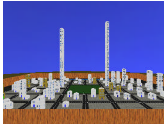
Figure 2 - Overview of entire district

In the past many of the issues surrounding software visualisation (more so than for other visualisations) have been based on the fact that all images are essentially nodes and arcs. The following issues also apply to these sorts of visualisation, but there is less scope for dealing with them. Graph layout is known to be a hard problem and layout algorithms have long been the focus of computer scientists; unfortunately focusing on mathematical properties of such rather than trying to address aesthetics and readability. To illustrate the background of some of this work Figure 3 has been included.